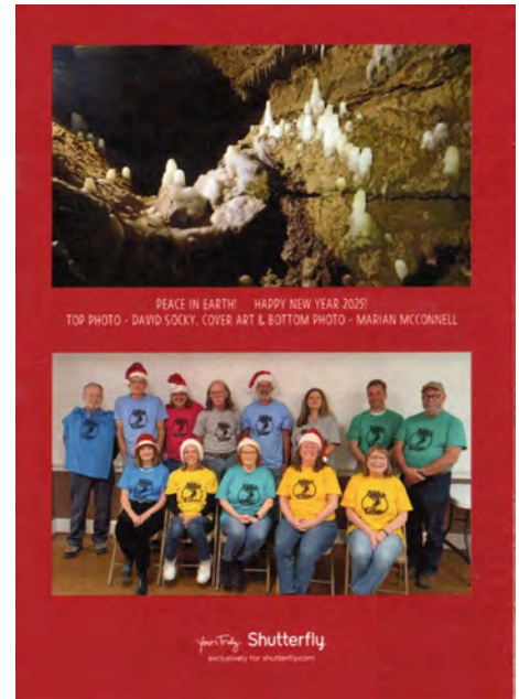
Back of the 2024 BRG Landowners Christmas Card