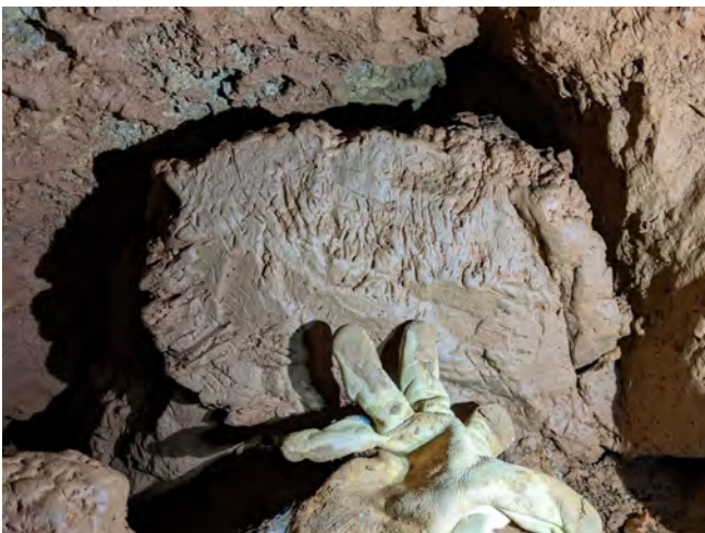
Raccoon scratch marks