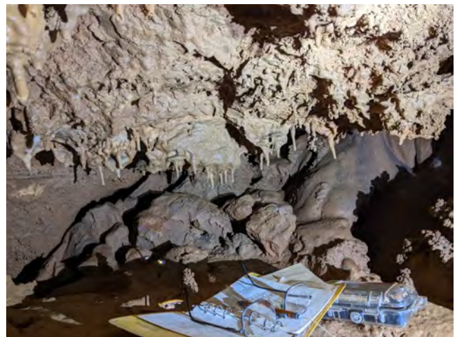
The formations were too small to sketch