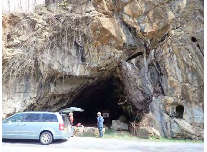
Entrance to Island Ford, April 2019.

beautiful pool near the back of the cave. We will take our time and enjoy the mud and the boiling spring.