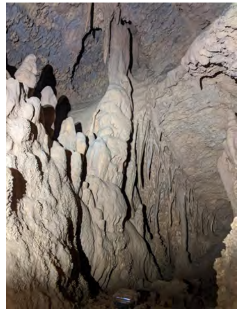
Old dry formations